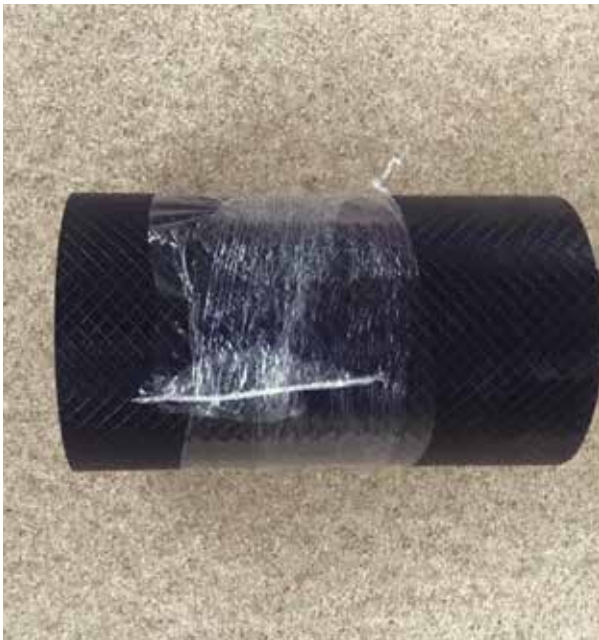
Damp proof course