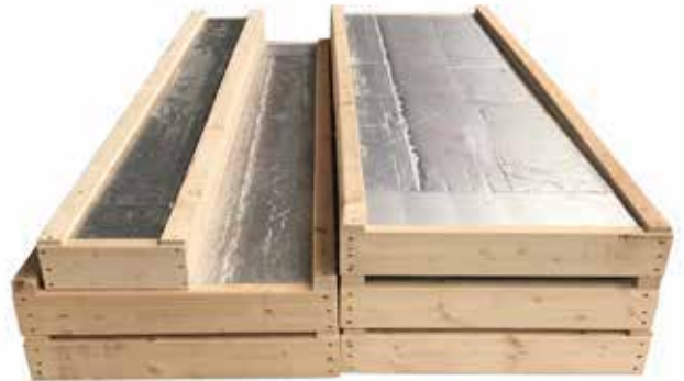
Roof cassette - various sizes