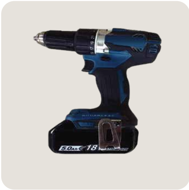
Battery combi drill