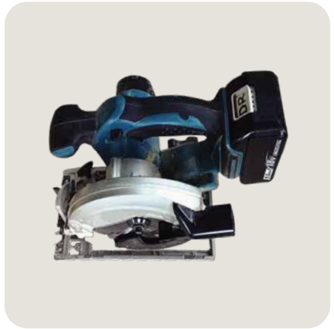
Battery circular saw