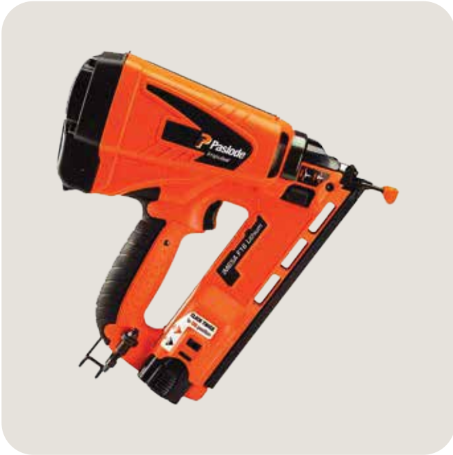
Pin Gun (Straight pins required)