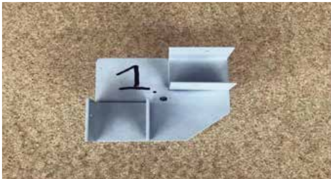
Type 1 foot - C